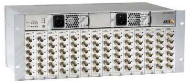
High density encoder

Encoders are available from a variety of manufacturers and depending on the manufacturer and model of encoder it may be supported by a variety of video management platforms allowing for a wide range of system configuration choices. Encoders may be more expensive on a per-video-channel basis than connecting cameras directly to a hybrid server because they are network connected. The network connection directly built into the encoder adds hardware cost, as well as additional infrastructure costs. Each encoder requires CAT5/5e/6 cabling and a switch port to connect to the IP network.