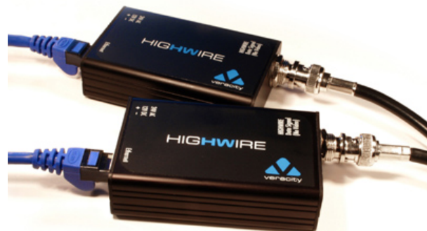
Coax to Ethernet media converter

The media converter allows the system designer to replace an analog camera with IP cameras without replacing the existing cabling infrastructure for the analog cameras. Without a