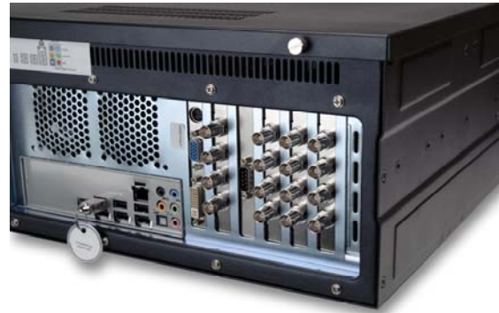
Server with video capture cards installed

A Hybrid Video Management System uses video capture cards installed in the server to capture the NTSC/PAL video signal, digitize it and compress the video. It provides a function similar to using an encoder separate from the video management software but combines the functions of encoding and video management into one device. Because each video capture card does not require as much intelligence as an encoder, and it does not need to have individual network communication capability, cost savings may be realized in product cost on a per-video-channel basis and infrastructure costs.