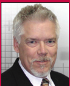
By Bill Lozon

Protecting national treasures means keeping security threats far from them or knowing well in advance when a threat exists. By securing both perimeters and indoor environments through a more accurate and discreet application technology, UWB adds a far more effective layer of protection.